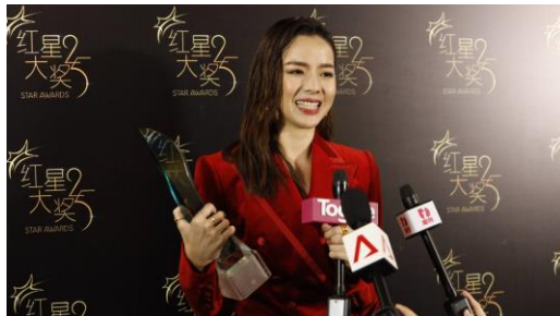
10 of 12 Interview process

As an actress, you definitely want to win everything you can. I hope to be able win professional acting awards, and to be considered for Best Supporting Actress. But there are a lot of veteran actresses who belong in that category and they are so experienced and so good. So as of now, any award is good. I work towards being better as an artiste. I don't dare to think too much about it lah 'cos I'm very, very new. I just want to do everything to the best of my abilities.