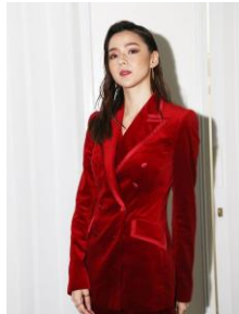
9 of 12 Red Hot

After the shoot, I met up with a couple of friends who are not in showbiz and let it all out over dinner. But I'm very thankful because I know that the criticism comes from a good place. It helps you improve quickly, especially when you are placed under that kind of pressure.