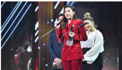
4 of 12 Speech therapy