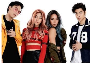
The Sam Willows