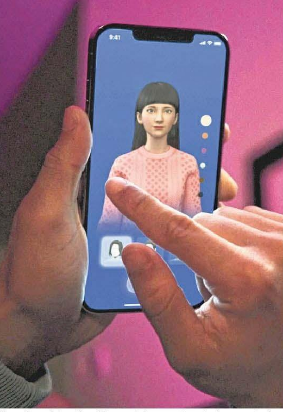
Above: A user interacting with a smartphone app to customise an avatar for a personal artificial intelligence chatbot, known as a Replika. Left: A virtual friend seen on the screen of an iPhone. Although current chatbot technology seems to offer a human-like chat experience, safeguards to prevent such bots from becoming unhinged might need to be strengthened.