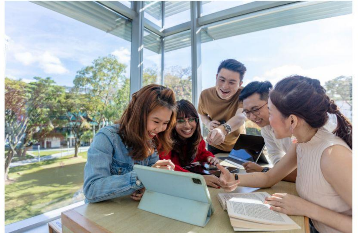
SMU's broad-based and rigorous interdisciplinary curriculum helps ensure that its graduates are adaptable and highly versatile.