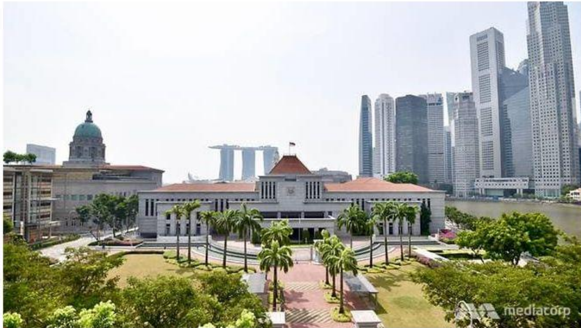
Parliament House, Singapore.

Low wage workers, sustainability and the youth among issues NMP candidates hope to raise in Parliament