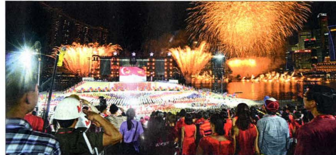
Fireworks lighting up the night sky during last year's National Day Parade. The SG50 Committee wants ordinary Singaporeans to have a hand in planning the celebrations for Singapore's 50th birthday.

"Many of us still remember the Kallang Roar in the days of the Malaysia Cup, or the mega-events at the stadium, like the concert by