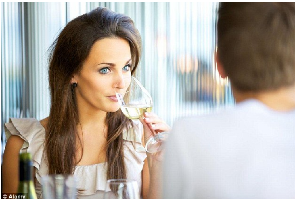
One night only: Women are attracted to men with wider faces - but not for a long term relationship (posed by models)

'Additionally, direct benefits of dominance like the provision of physical protection might outweigh low prospects of long-term investment sometimes, again supporting female mate choice for dominance in short-term relationships.'