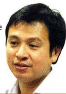
Mr Chia Shi-Lu FIRST TERM PEOPLE'S ACTION PARTY MP

“The high points for myself were the discussion and debates on issues that I have always cared very much about ... Many points that I brought up in Parliament regarding healthcare reform have been acted upon ... Sometimes, the small victories are the best, such as the call for the removal of the administrative fee for the use of Medisave under certain situations in the outpatient setting.