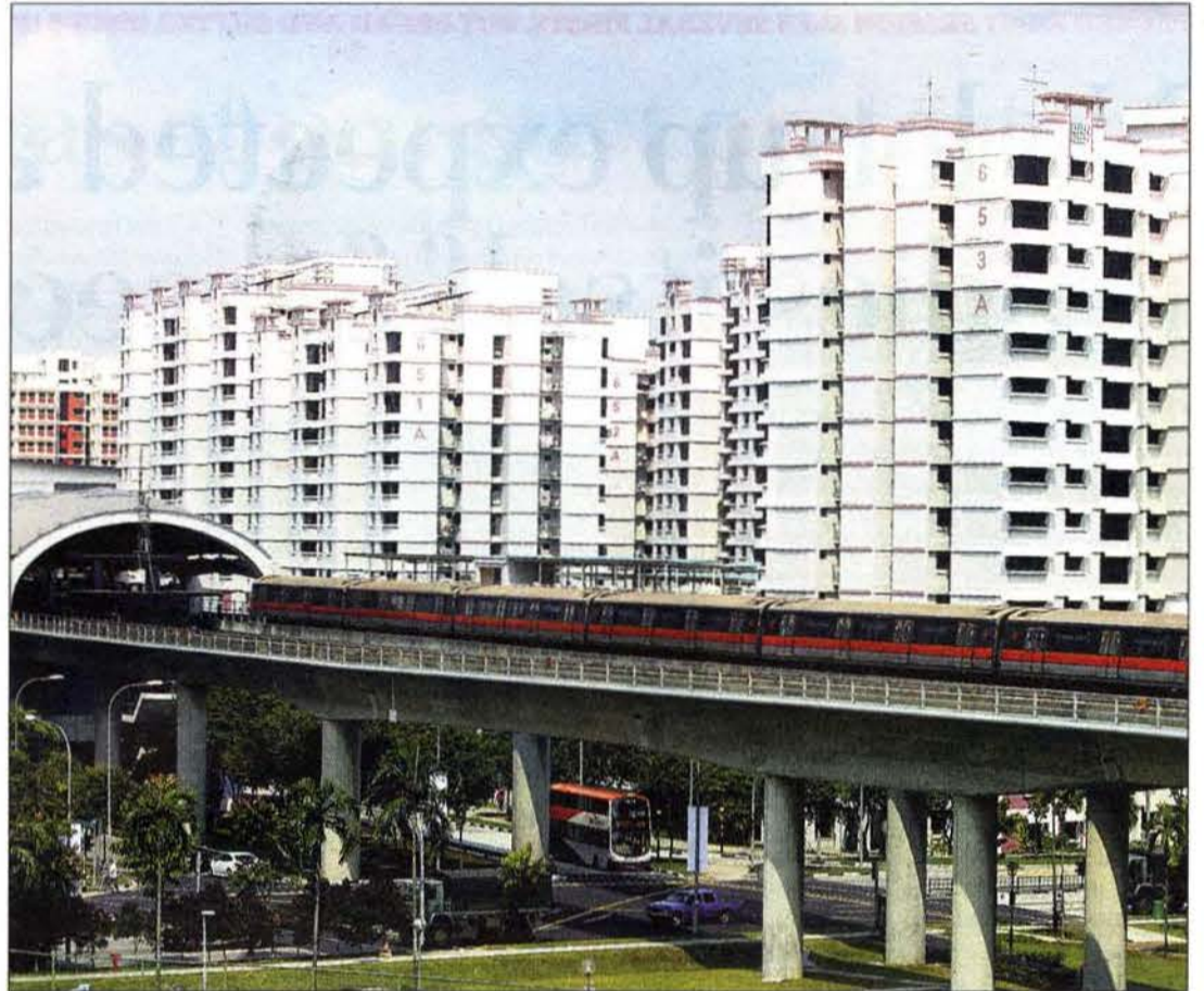
Despite historic moments such as the Little India riot, it was bread-and-butter issues, including the frequent MRT breakdowns and the rising cost of housing, that dominated parliamentary proceedings.

Several PAP first-termers said they were gratified to have made a