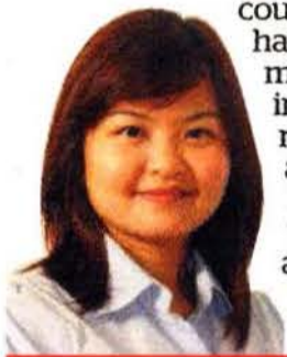
Ms Lee Li Lian FIRST TERM WORKERS' PARTY MP

“With the increase in Opposition MPs, we have been able to cover a wide (range) of policy issues ... and, of course, with additional MPs, we have given opposition views more air-time. Despite the increase in numbers, the total number of Opposition MPs and NCMPs remains only 10 of 90 (excluding NMPs) so, while we are making an impact, we are still small in numbers.