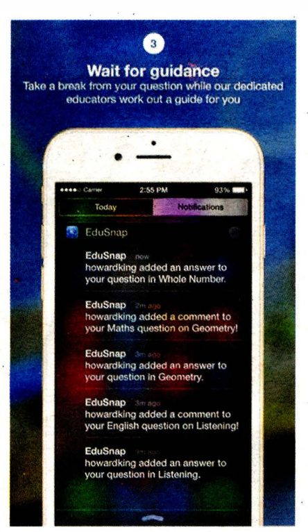
GETTING STARTED: Take a shot of the difficult question, upload it and wait for a reply.