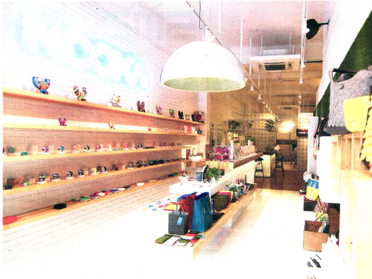
LAZY DAY OUT: The retail space (above) and the nail parlour (below) have a low-key charm.