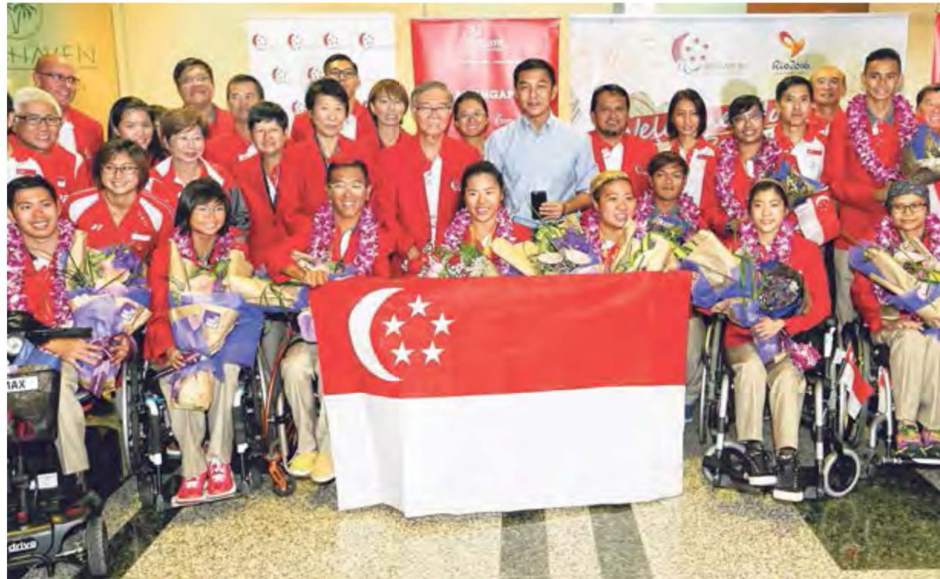
Eleven of Team Singapore's Paralympians, including medallists Yip Pin Xiu and Theresa Goh, will be waving to crowds in a celebratory parade from Sengkang Sports Centre to VivoCity tomorrow.