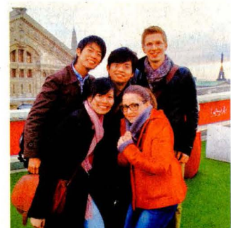
Students cultivate a worldview and experience independent learning overseas during exchange.

Through overseas internships, students experience firsthand how industries and businesses operate in other markets and practise what they’ve learnt in a real-world setting. They also establish connections that could lead to full-time employment opportunities. Over 50% of SMU students do between two to six internships before graduation and one in 10 travels overseas to gain valuable experience.