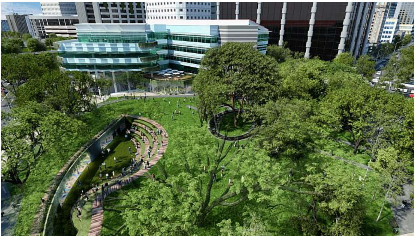
An artists' impression of the Campus Green.