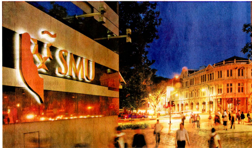
Global city campus at the heart of Singapore.