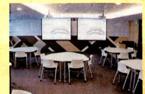
Collaborative space at a Learning Lab.

seminars, the Learning Labs can be booked by faculty or be used by students for learning activities.