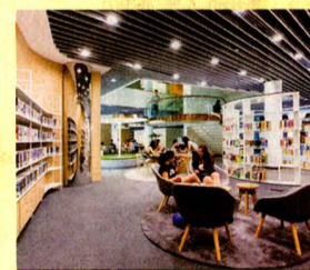
The newly renovated Li Ka Shing Library.

In response to SMU students' evolving needs and higher expectations, measures were taken to enhance the number, quality and variety of its learning spaces. Students can now enjoy working in an even more comfortable and inviting environment that inspires learning, reflection and creativity. This has led to increased satisfaction and appreciation of the library and its facilities. The Library now provides 24/7 Learning Commons and dynamic work spaces that are open all year round. Some notable enhancements in facilities include: