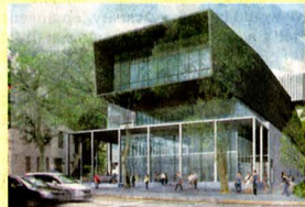
Artist's impression of SMU's new School of Law building.

SMU's new School of Law building has made it to the list of 50 Most Impressive Law School Buildings in the World by Best Choice Schools. The building has been designed with sustainable features that will bring maximum energy savings. It also respects the urban fabric of the Civic District and builds upon the porosity of the city campus – as a 24/7 public link between Armenian Street and Stamford Green – to promote engagement with the community. In addition, students will get to enjoy convenient access to real-world court proceedings, key business partners and prestigious law firms in the CBD and MBFC area.