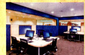
High-end databases at the Investment Studio.

With high-end finance databases such as Bloomberg and Eikon under one roof, complete with large collaboration tables and sophisticated video projection equipment, group discussions are brought to a whole new level.