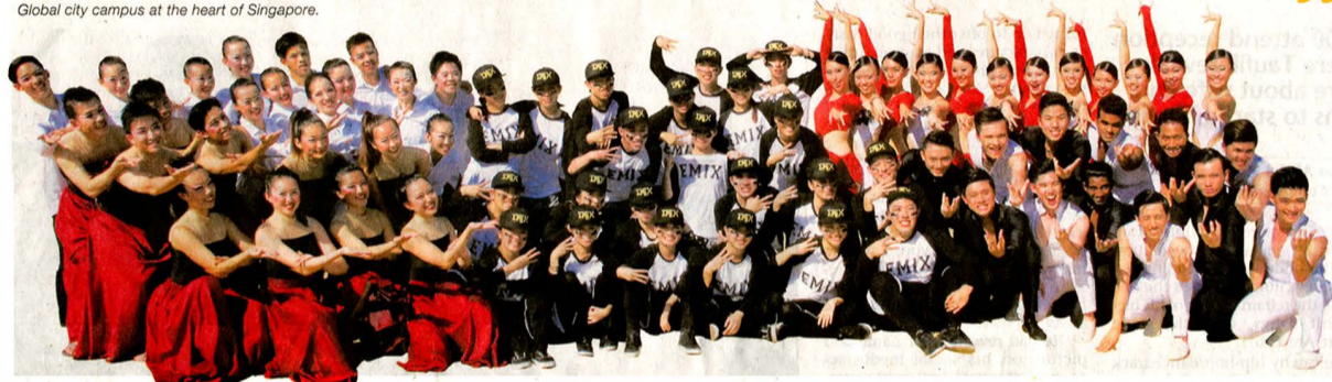
SMU dance groups enjoyed great success at the Barcelona Dance Grand Prix with each team winning the first prize.

“ Surrounded by museums, educational institutions, art galleries and retail outlets, we have a unique modern city campus that's also connected to the origins of this important historical district. ”