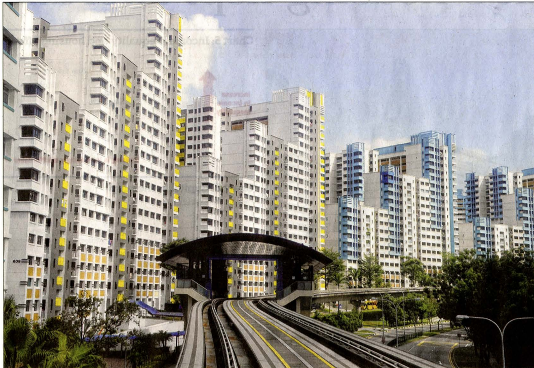
As a global superstar city as well as a nation state, Singapore has harnessed the entire spectrum of land and housing policies to keep housing prices affordable. Its house price to income ratio of five is the lowest among the global superstar cities.

In most European countries, the richest 10 per cent own around 60 per cent of national wealth, the poorest 50 per cent invariably own less than 5 per cent.