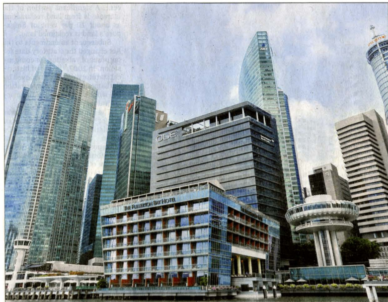
In the Economist Intelligence Unit's Global City Competitiveness Index, Singapore is ranked third in global competitiveness, and the most globally competitive in Asia.