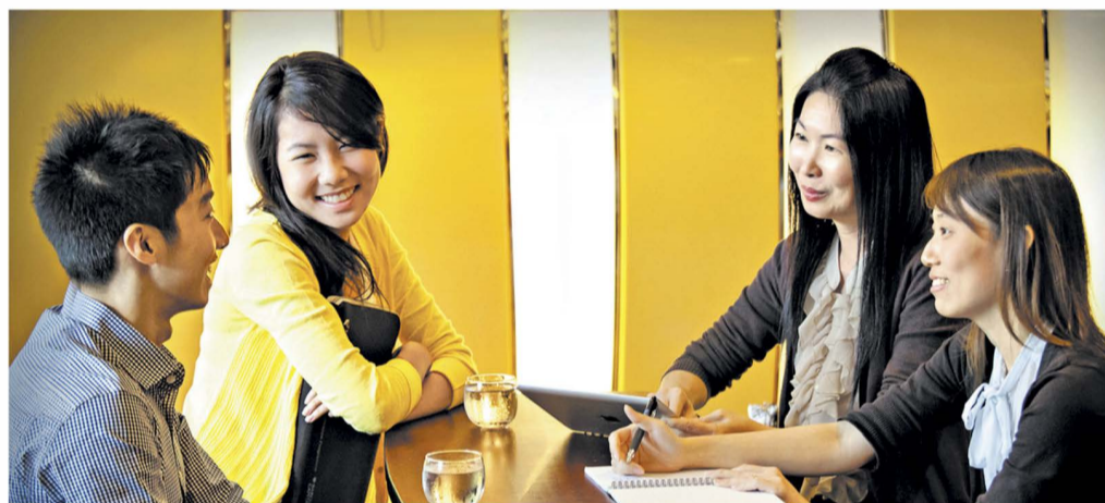
Generous financial aid schemes ensure deserving students have the opportunity to receive a well-rounded education.

Over 200 financial aid schemes and scholarships provide students the peace of mind and freedom to pursue the education they deserve