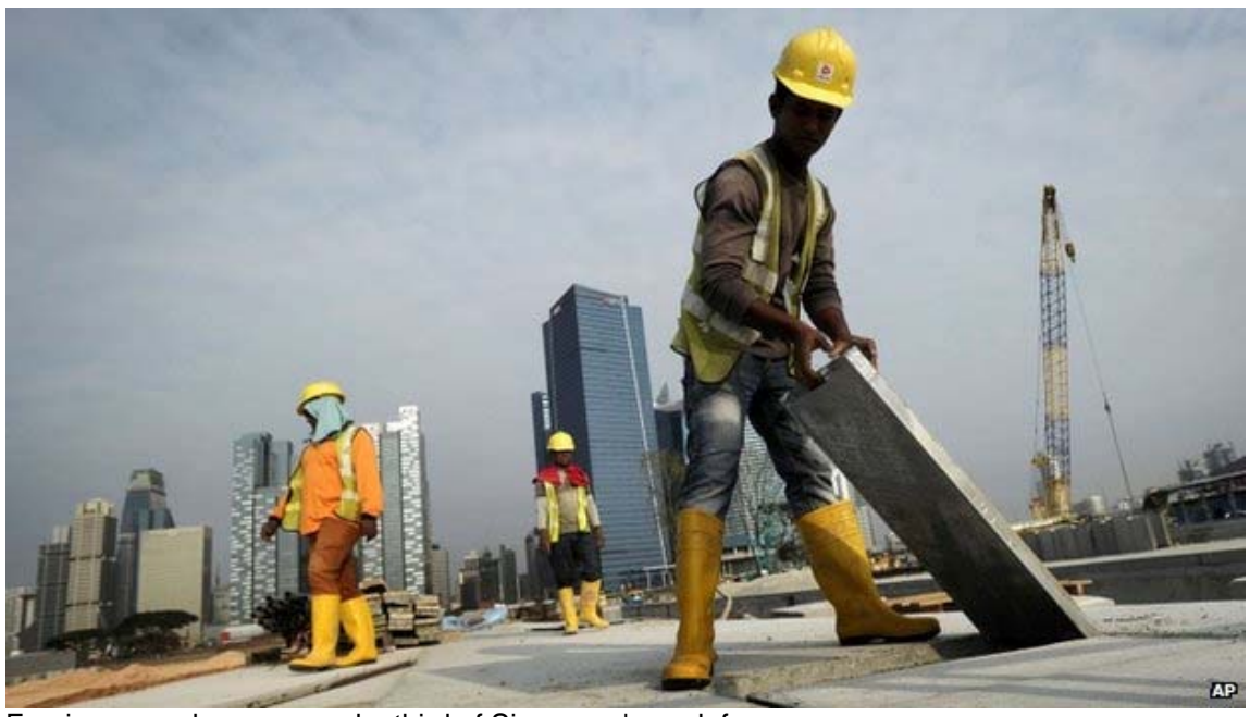
Foreigners make up around a third of Singapore's work force

The UN has noted that article 12(2) does not extend its protection to non-citizens of Singapore.