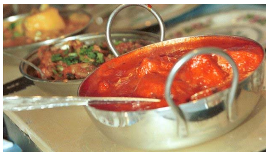
Some landlords are influenced by stereotypes about which migrant groups cook "heavy" foods

Headline: 'No Indians No PRCs': Singapore's rental discrimination problem