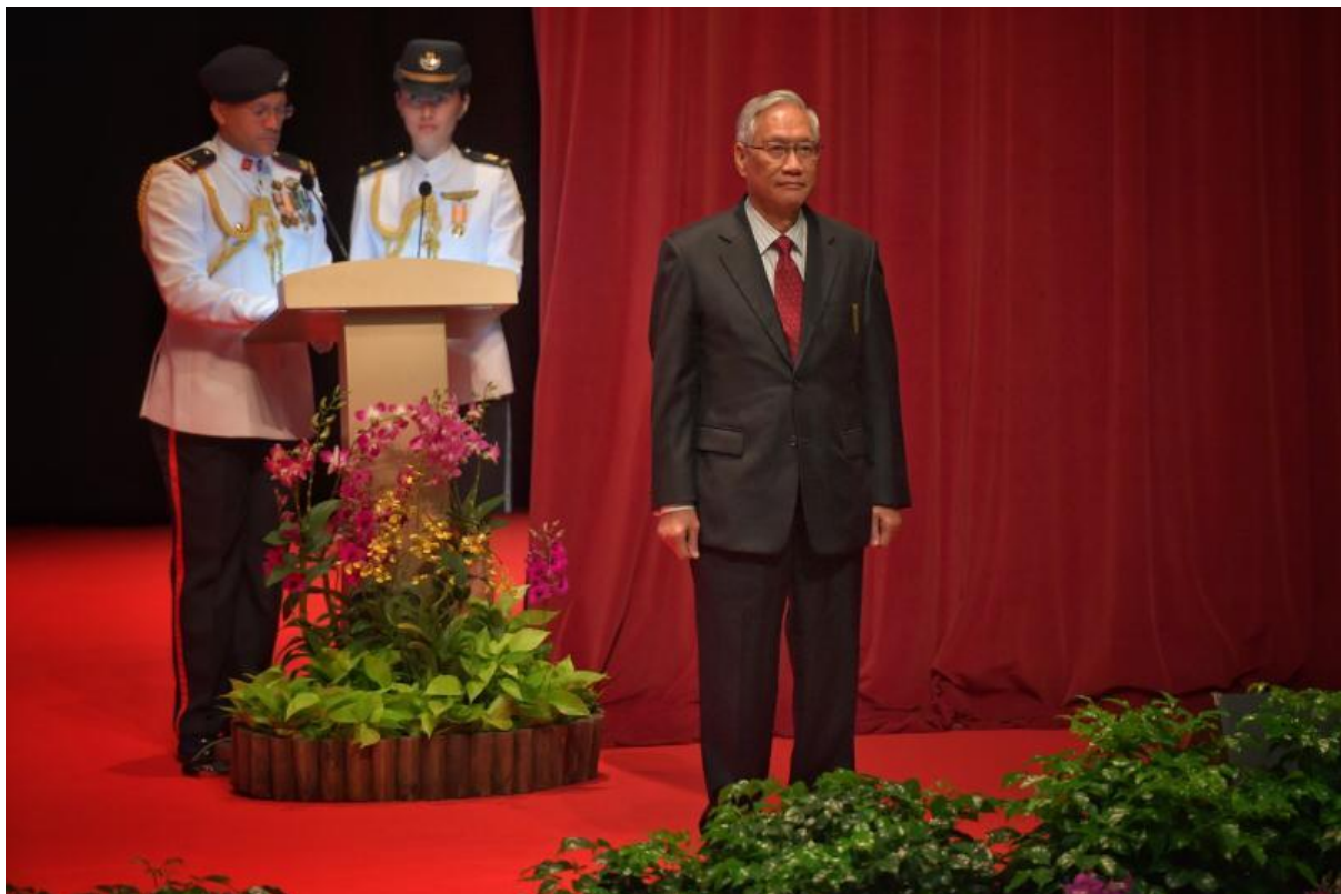
Mr Lim Chee Onn, a member of the Council of Presidential Advisers.

The next highest award presented on Sunday was the Order of Nila Utama (With High Distinction) to former minister Lim Chee Onn.