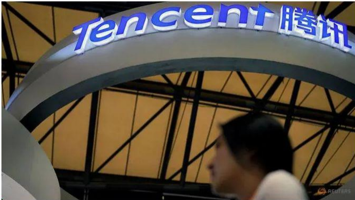
A Tencent sign is seen during the China Digital Entertainment Expo and Conference (ChinaJoy) in Shanghai, China August 3, 2018.

This tighter control of SOEs by the Communist Party is not necessarily problematic, though it may result in anti-competitive effects. After all, SOEs may not behave like private firms but pursue political or public policy goals directed by the Party.