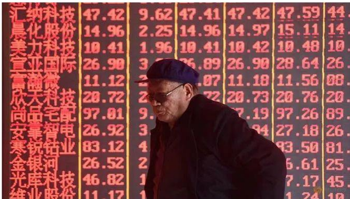
A man stands in front of an electronic board displaying stock information at a brokerage firm in Hangzhou, Zhejiang province, China April 1, 2019.

These also raise difficult problems for authorities in other countries, who oversee competition matters and have to grapple with issues such as whether Chinese SOEs should be treated as a single entity controlled by the Chinese Communist Party.